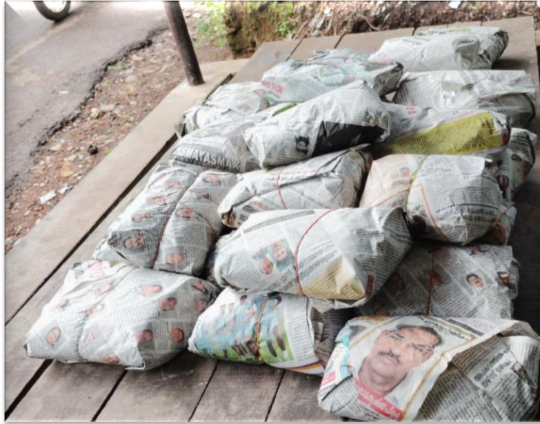
Food packets collected by students