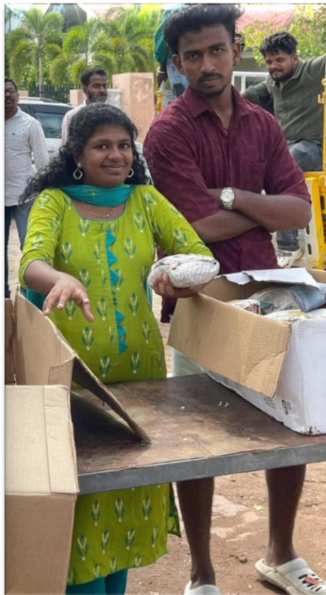
Distribution of food packets by students