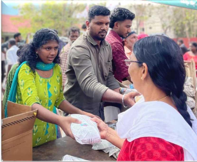
Distribution of food kits